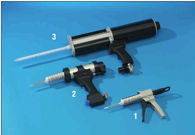
The EPX applicators

The adhesive is extruded through a static mixing nozzle, which ensures that the two components are mixed together thoroughly every time. The mixing nozzle can be adapted to extrude different bead diameters by cutting the tip.